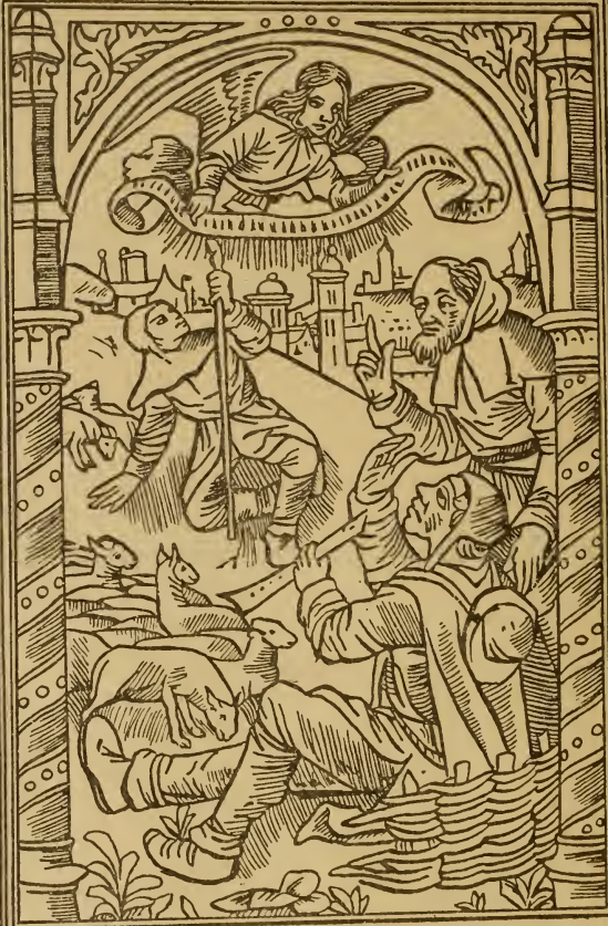
The Day-Hours of the Church of England